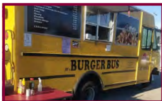
LEFT: The Kropf's use a gas engine to churn their ice cream RIGHT: JR's Burger Bus