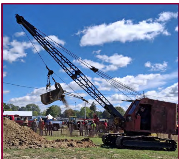
Antique Drag Line, Model LS-68, owned by Mike Sillib. An example of a mechanical crane manufactured by Link-Belt in the early '60's