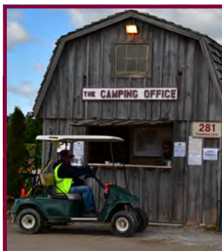
Camp Office at Blyth Rd. 25 Gate

No arrivals before Tuesday, September 2, 2025