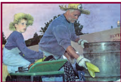
LEFT: The Bean Pot - Daily - Friday, Saturday, Sunday at Noon. RIGHT: Corn Roast - Daily - Thursday, Friday, Saturday at 7:00PM.