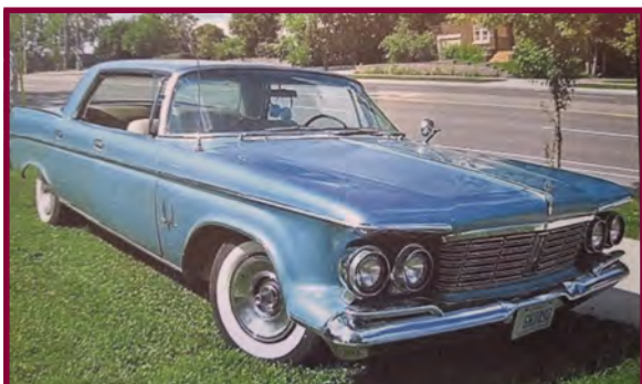
1963 Chrysler Imperial Crown, owned by Steve Lovegrove of Burlington, Ontario