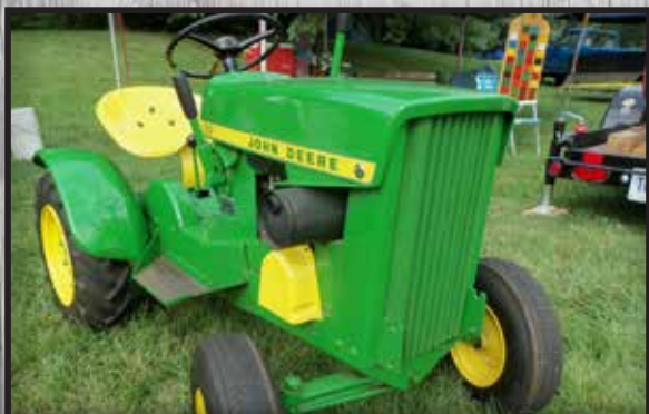
Antique John Deere Lawn & Garden Tractor