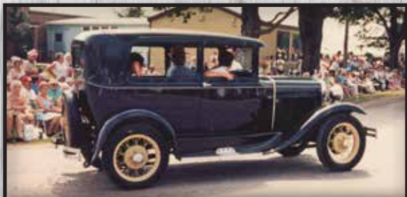
1931 Ford Model "A" Owned by Gary Squire