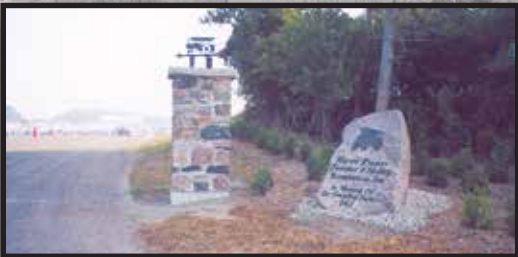
Entrance to Threshers Campground

No arrivals before Tuesday September 6, 2022