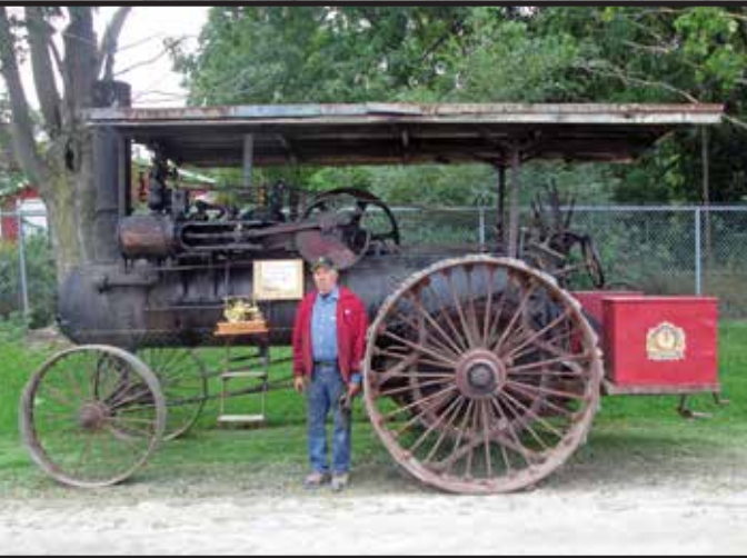
1929 20HP Waterloo Owned by Bruce Shillinglaw Londesborough, ON